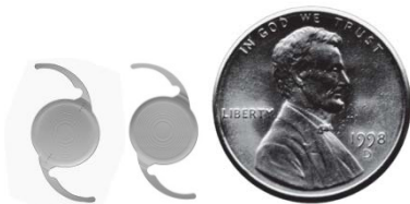
Figure 2: Size comparison of two TECNIS® Symphony Extended Range of Vision IOL model types and U.S. penny

The most common treatment for cataract today is to remove the clouded natural lens. It is then replaced with an artificial lens. This artificial lens is called an intraocular lens (IOL). Figure 2 below compares the size of a TECNIS® Symphony Extended Range of Vision IOL to a U.S. penny.